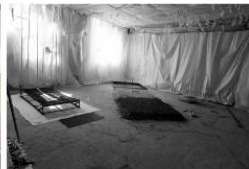
Figure 3. Private Exhibition of a Group of Works at École des Beaux-Arts: Resistance: in Memory of a Dead Mattress (1974), Iron Earth Copper Sky (1975), Resistant Area (1975), The Heating Coil and Resistance in a Capillary Long Tube (1975).