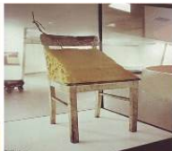
Figure 2. Hit Chair, 1964, Wooden Chair, Animal Fat [13]