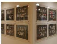
Figure 5. Cengiz Celik, What Time Is It?, 2008 112 pieces, each piece 58x75.7cm [18]