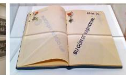
Figure 6. Cengiz Celik "Diary", 2011 [20]