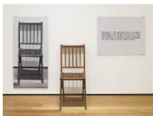
Figure 1. Joseph Kosuth, 'One and Three Chairs' 1965, folding chair, photograph of a folding chair, photograph of the lexical meaning of chair. Chair: 82x37.8x53 cm, folding chair's photograph: 91.5x61.1 cm, photograph of the chair's lexical meaning: 81x61.3 [7].

[Full text- PDF ] [ HTML ] [ ePub ] [ XML ]