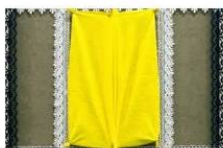
Figure 4. Yellow Rubber, 2019 [17]