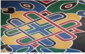
Figure 1. One North