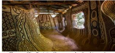
Figure 2. Uti wall painting