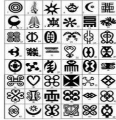
Figure 4. Yoruba traditional symbols

Abodunrin JA (2019). Indigenous forms and materials in Nigerian painting. J Art Arch Stud , 8 (1): 07-12.