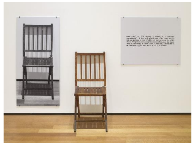
Figure 1. Joseph Kosuth, 'One and Three Chairs' 1965, folding chair, photograph of a folding chair, photograph of the lexical meaning of chair. Chair: 82×37.8×53 cm, folding chair's photograph: 91.5×61.1 cm, photograph of the chair's lexical meaning: 61×61.3 [7].

Joseph Kosuth's "One and Three Chairs" is one of the most important examples of Conceptual Art. In this work, a chair stands alongside a photograph of a chair. And next to the actual chair there is a photograph of a verbal dictionary explanation of the word 'chair' hung on the wall. Eventually all of these three objects represent the chair, yet with different codes. Thus exhibiting these verbal, visual and representative codes of a single object together has been the smartest way to bring the connection and irrelevant connection between the 'referent' and the 'signifier' into question [1].