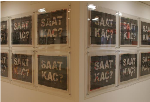
Figure 5. Cengiz Çekil, What Time Is It?, 2008 112 pieces, each piece 56×75.7cm [18]

consistently produces life-dominant dynamics and indicators identified by mainstream media. On these sheets behind a glass frame stands a semi-transparent bold face ‘What Time Is It?’ question. Although it is hard to read the news behind this glass and letters, it is still visible. The abundance of images and words on the sheets points out the life’s preciousness and fragility by countless repetition of the same question which interrogates the meaning of daily routine [13].