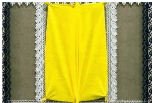
Figure 4. Yellow Rubber, 2013 [17]

In his exhibition "What Time Is It?" (Figure 5), he brought a series of his works together, which all concentrate on the same causal questions. This installation reminds of his work-series called 'Unlettered' (1975-1977) in which he used newspaper for the first time as a material. What Time Is It? displays for one week, newspaper sheets chosen from Hürriyet (a Turkish local paper), which