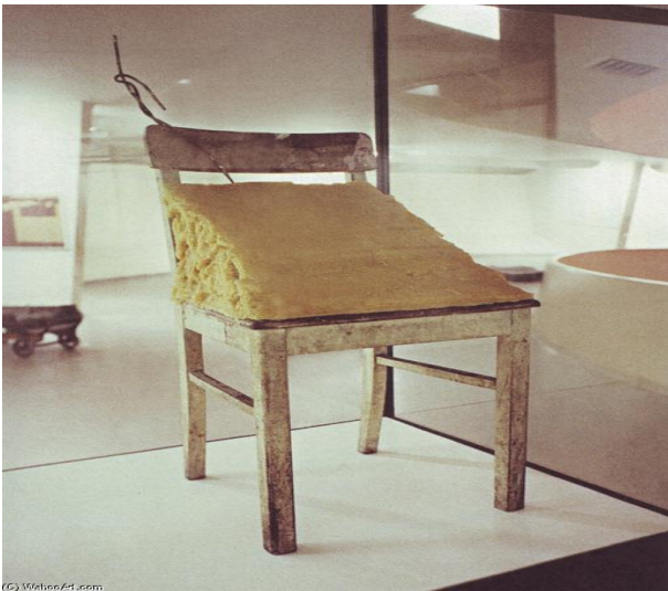
Figure 2. Fat Chair, 1964, Wooden Chair, Animal Fat [11]

Yet another outstanding Conceptual Artist is Joseph Boyes. Apart from his interesting life story, participating in Fluxus and producing conceptual artworks by using ordinary matters like fat, felt, etc., transformed him into the most conspicuous artist of this movement. Beuys said: "I tried to separate the concept of plastic into three simple objects. But this is not solely limited with objects that are physically perceivable. The same thing applies to plastic materials which are invisible. I start using unspecified materials like fat and soil, and through a certain action, I reconstruct a new form from these" [10].