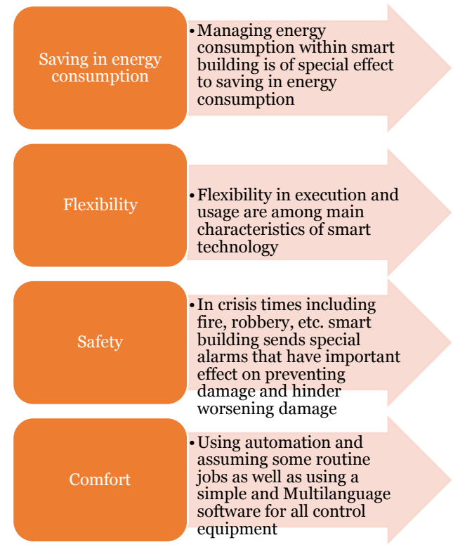
Figure 3: Benefits of Smart Buildings, [6].

Using the latest technologies, smart management system of buildings aimsat providing ideal conditions along with efficient use of energyin buildings. Four following benefits can be critical reasons for using such system in buildings.