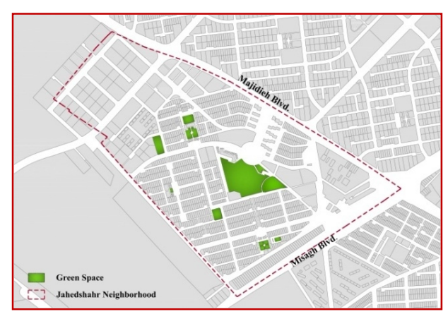
Figure 4: Scattering of green spaces in Jahedshahr neighbourhood