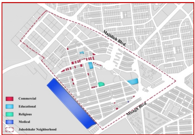
Figure 2: Scattering of service uses in Jahedshahrneighborhood